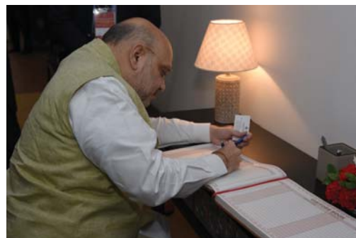
Hon'ble Home Minister signing the visitors book at BPR&D HQ at New Delhi.

Before his address, the Hon'ble Home Minister unveiled the "Golden Jubilee Logo" of the BPR&D and also released the latest edition of the "Indian Police