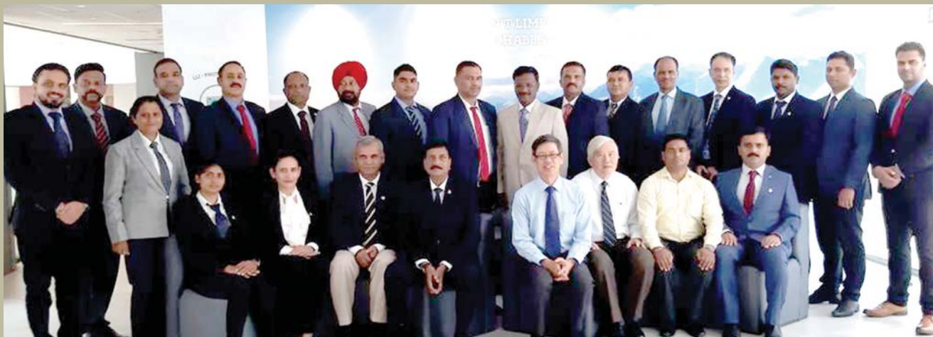
4 th Batch