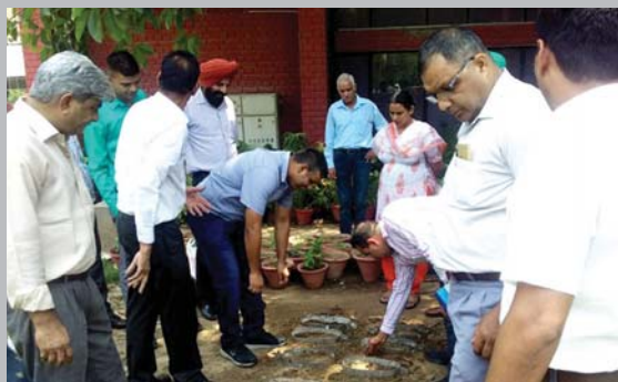
Trainee police officers doing simulation exercise activities.

DG, BPR&D, visited Chandigarh on 17 July, 2019, and interacted with the trainee officers. The interaction was a lively affair, wherein DG, BPR&D, and, the participants exchanged perspectives on issues pertinent to the focal subject of the program. ●