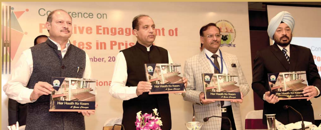
Shri Jai Ram Thakur, Chief Minister of Himachal Pradesh, launching the book, titled "HAR HAATH KO KAAM: A GAME CHANGER"

Prisons Department, Himachal Pradesh, in collaboration with BPR&D, organized a two day Conference on 'Positive Engagement of Inmates in Prisons' on 18-19 September, 2019, at Shimla, Himachal Pradesh. The conference was inaugurated by the Hon'ble Governor of Himachal Pradesh, Shri Bandaru Dattatreya. The Chief Guest for the closing ceremony was the Hon'ble Chief Minister, Shri Jai Ram Thakur. The conference was attended by more than 100 delegates from 20 different States and UTs; Institute of Correctional Administration, Chandigarh; members of civil society, domain experts, academics, eminent writers, govt. officials and senior representatives from the industries. ●