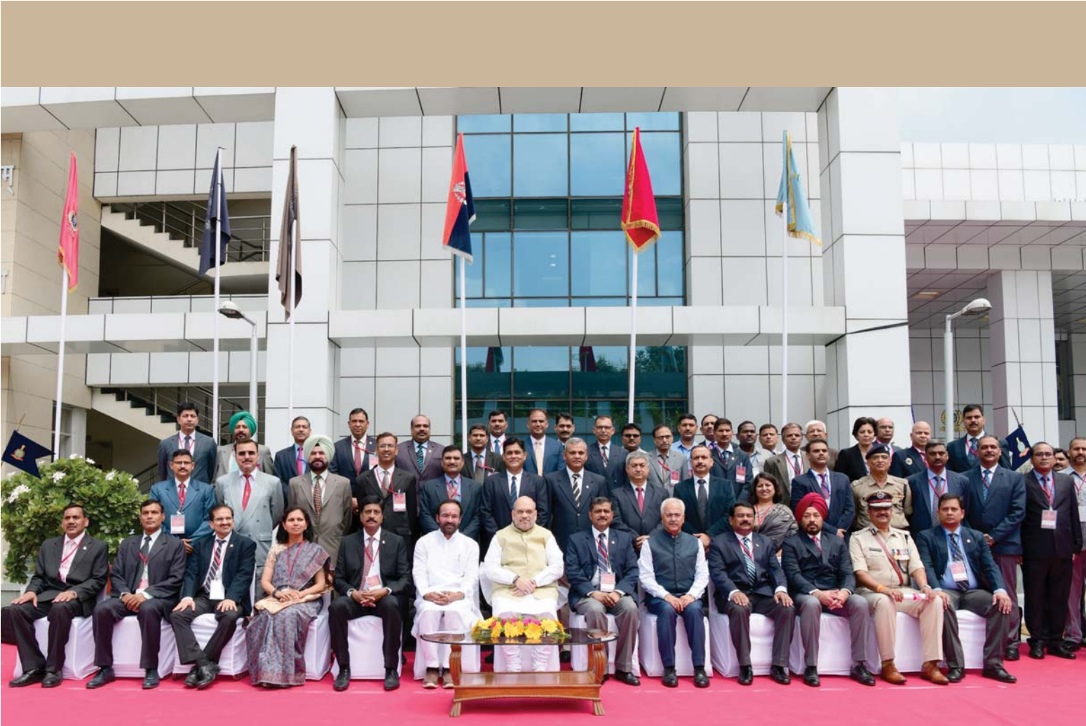
Hon'ble Home Minister with BPR&D officers & staff during his visit on 49 th Foundation Day - 28 th August, 2019

Newsletter of Bureau of Police Research and Development, Ministry of Home Affairs, Govt. of India