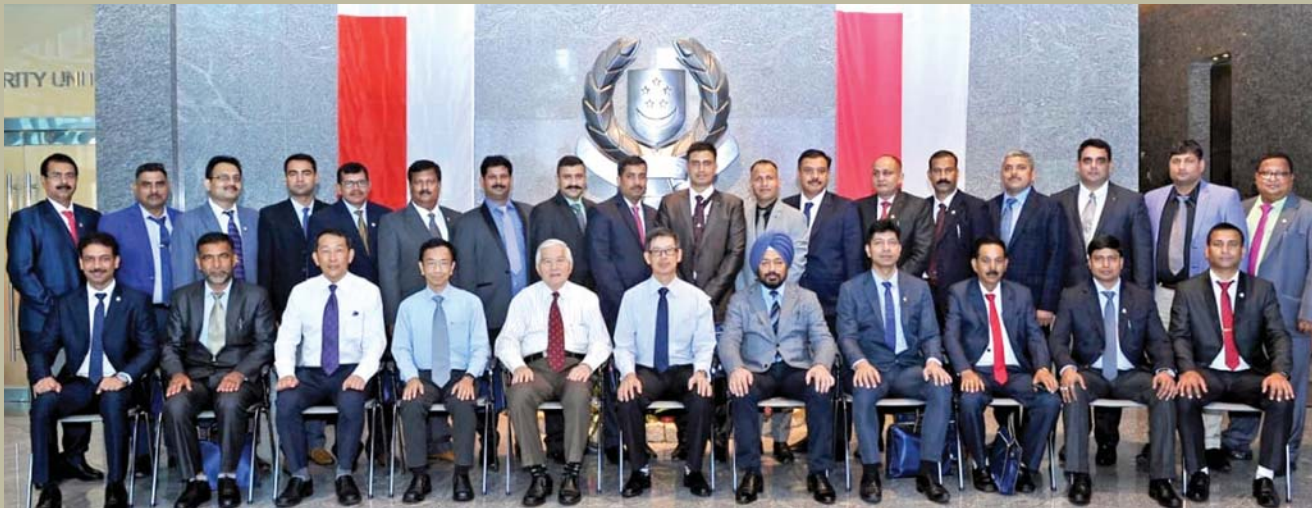
3 rd Batch

Two batches each of 23 and 20 participants, respectively, underwent course on 'Crime Scene Management & Forensic Science', at the Police Training Command, Singapore, to hone their investigation skills as part of DSI Scheme.