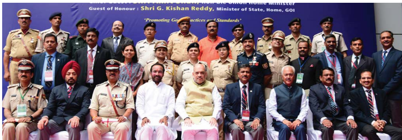
Hon'ble Home Minister and Hon'ble MoS-Home with BPR&D Officers & Award winners on the 49 th Foundation Day Function of BPR&D

Shri G. Kishan Reddy, Minister of State for Home Affairs, also addressed the gathering. He acknowledged the role of police and the grave challenges faced by them and emphasized the need for modernization of Police Forces and in-service specialized and refresher training, given the complexity of crimes and the need to develop domain expertise in policing. He expressed his concern about the safety and security of women and the need for special measures to counter the same. ●