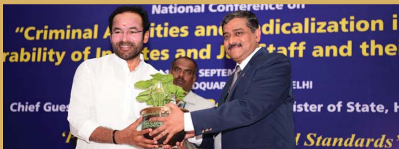
DG BPR&D felicitating Shri G Kishan Reddy, Honble Minister of State for Home, Govt of India.

The conference was attended by more than 130 participants, comprising of Correctional Administrators and Police Officers of States/UTs, representatives of NGOs and academicians from renowned Universities and Institutes. ●