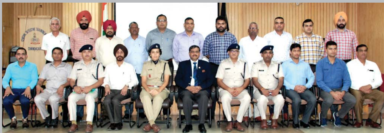
Participants of 106 th AICDC with DG, BPR&D, at the CDTI Chandigarh